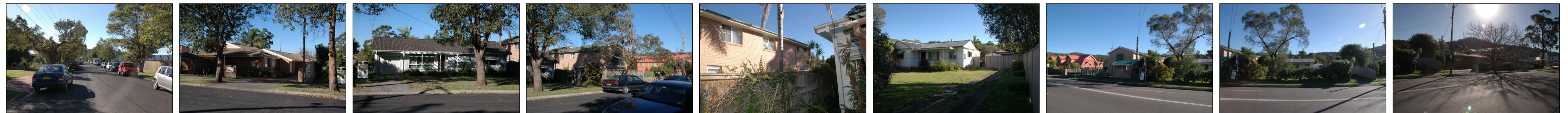
PHOTO 1: VIEW NORTH UP HENRY KENDALL ST TOWARDS WEST GOSFORD SHOPPING CENTRE PHOTO 2: NO. 24 HENRY KENDALL ST SINGLE STOREY RESIDENTIAL MEDIUM DENSITY PHOTO 3: NO. 26 HENRY KENDALL ST SUBJECT SITE- TO BE DEMOLISHED PHOTO 4: NO. 28 HENRY KENDALL ST. 2 STOREY RESIDENTIAL MEDIUM DENSITY PHOTO 5: VIEW OF ADJOINING DEVELOPMENT NO. 28, TO THE SOUTH, FROM BACKYARD OF SUBJECT SITE PHOTO 6: NO. 263 BRISBANE WATER DRIVE SUBJECT SITE- TO BE DEMOLISHED PHOTO 7: ADJOINING DEVELOPMENT SOUTH OF NO. 263, NO. 259 & 261 PHOTO 8: NO. 263 BRISBANE WATER DRIVE AS VIEWED FROM ACROSS THE RD. PHOTO 9: ADJOINING DEVELOPMENT TO NORTH NO. 265 & 267